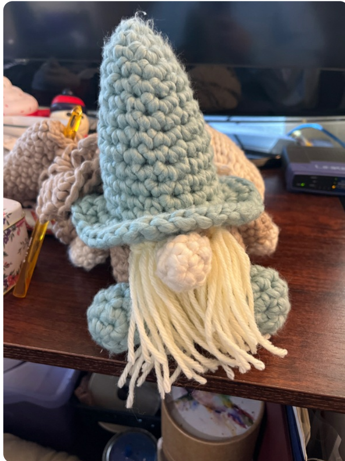
A small crochet gnome